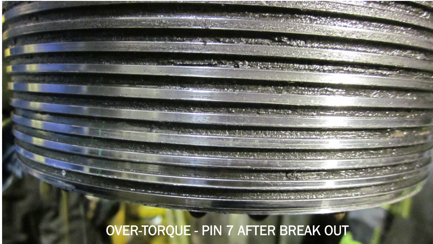
OVER-TORQUE - PIN 7 AFTER BREAK OUT