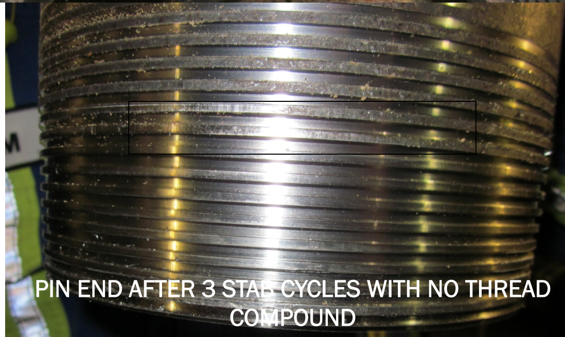
PIN END AFTER 3 STAB CYCLES WITH NO THREAD COMPOUND